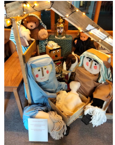
The Re-Cycled Crib Scene in the church foyer

Val’s hip replacement operation was postponed and is waiting for a new date.